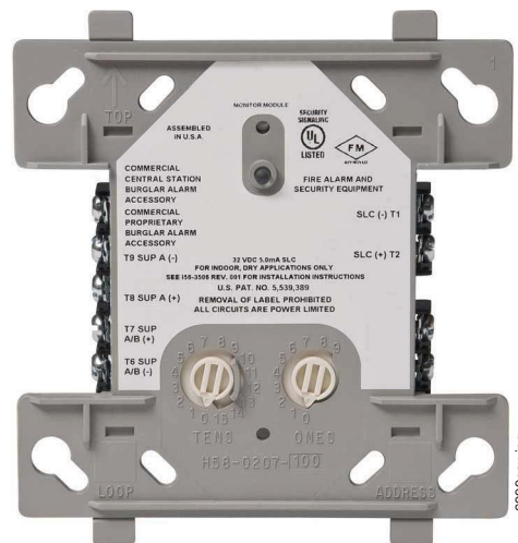
FMM-1(A) (Type H)

Use to monitor a zone of four-wire smoke detectors, manual fire alarm pull stations, waterflow devices, or other normally-